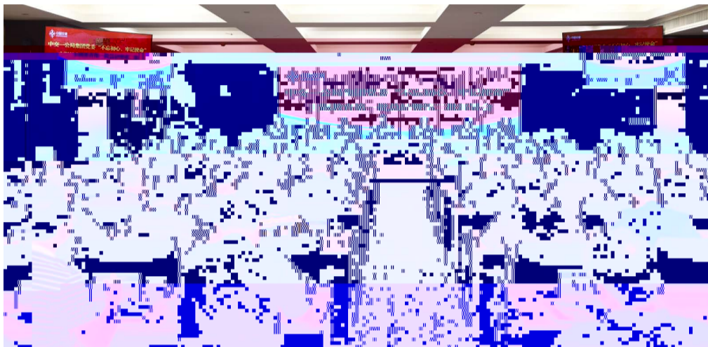
“ 9 18 ”